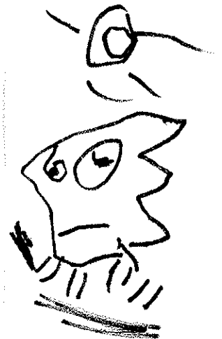
a baby owl